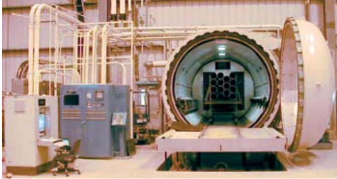
The Autoclave at NCAM sits open as engineers prepare to cure a stack of components made from the center's composite manufacturing processes. (LMSSC-MO)

The autoclave located at the center is capable of withstanding high temperatures and pressures. It applies heat and pressure in a controlled environment, providing the conditions needed to manufacture many of today's space-age composite materials. The 10-by-20-foot autoclave cures parts made from the fiber placement machine and other composite manufacturing processes.