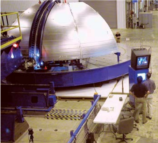
NCAM's Friction Stir Welding System produces a uniform weld as it joins the panels of an elliptical dome structure. (LMSSC-MO)

process employs a pin tool with a low rotational speed and applied pressure that “mechanically stirs” two materials together to produce a uniform weld – a vital requirement of next-generation launch vehicles and hardware that must endure long-term space travel.