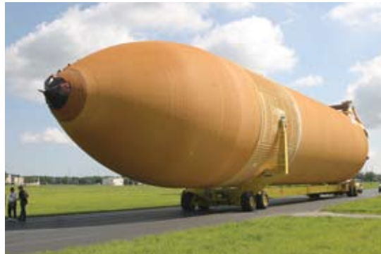
A space shuttle external tank is on the move at Michoud Assembly Facility in New Orleans.

The National Center for Advanced Manufacturing is located on the 832-acre NASA Michoud Assembly Facility in eastern New Orleans. Managed by NASA's Marshall Space Flight Center in Huntsville, Ala., Michoud has a long, successful history and proven expertise in the manufacture and assembly of large aerospace systems and structures supporting NASA programs and projects.