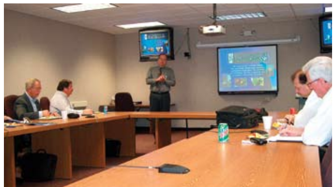
NCAM's video conference system allows classes to be broadcast to NASA, various universities and industries.

As part of the University of New Orleans' College of Engineering, the National Center for Advanced Manufacturing also offers advanced educational courses and distance learning to senior and graduate students and members of the aerospace industry in an effort to grow the minds of tomorrow's scientists, researchers and manufacturers.