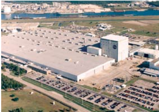
An aerial view of the manufacturing plant which houses the National Center for Advanced Manufacturing at NASA's Michoud Assembly Facility in New Orleans, LA.

The National Center for Advanced Manufacturing is a partnership between NASA, the state of Louisiana and the University of New Orleans. Founded in 1999, the center provides research and advanced manufacturing technology for use in aerospace and commercial markets.