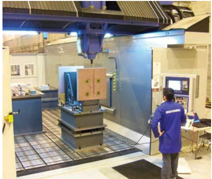
An engineer prepares composite material for machining on the Gantry Machining Center, which measures 23 feet in diameter and is 11 feet high and five feet wide.

The Gantry Machining Center is a 5-axis, high-speed system that can machine complex components using multi-axis capability. This technology is capable of machining both composite and metal materials using a 24,000-revolutions-per-minute, 60-horsepower cutting spindle.