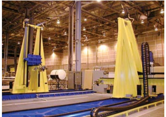
NCAM's Non-Destructive Evaluation System measures 24 feet in diameter and is 12 feet high and 10 feet wide.

The Non-Destructive Evaluation System applies non-destructive evaluation techniques in the testing of composite materials by employing a twin 5-axis traveling column configuration and multiple inspection system capability. The system tests the strength, structural integrity and reliability of a component or material for use in the space environment.