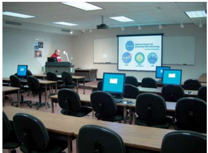
One of two on-site classrooms at the National Center for Advanced Manufacturing. (NCAM)

The center includes two on-site classrooms, providing students an interactive environment with engineers, scientists and researchers for engineering courses taught by the National Center for Advanced Manufacturing. Its educational program includes curriculum leading to a master's degree in engineering with an emphasis on composites.